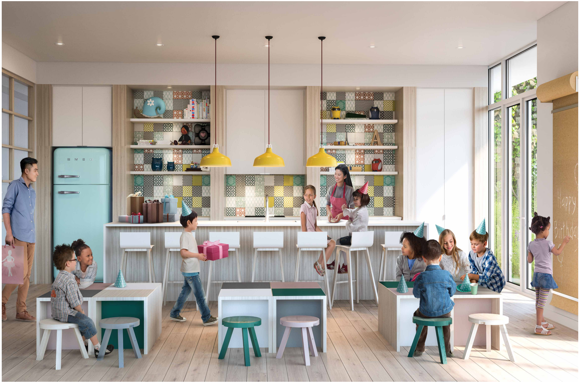
KID'S PARTY ROOM