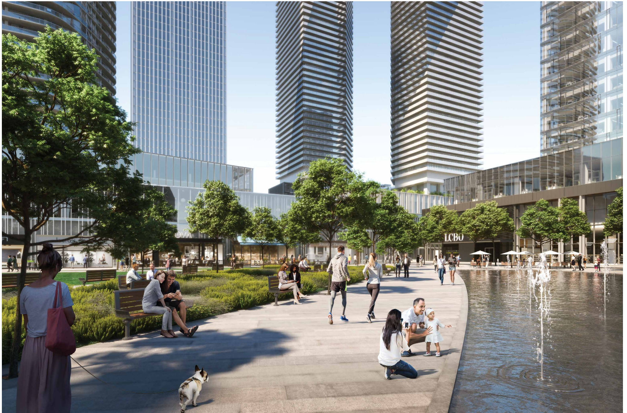
2-ACRE COMMUNITY PARK