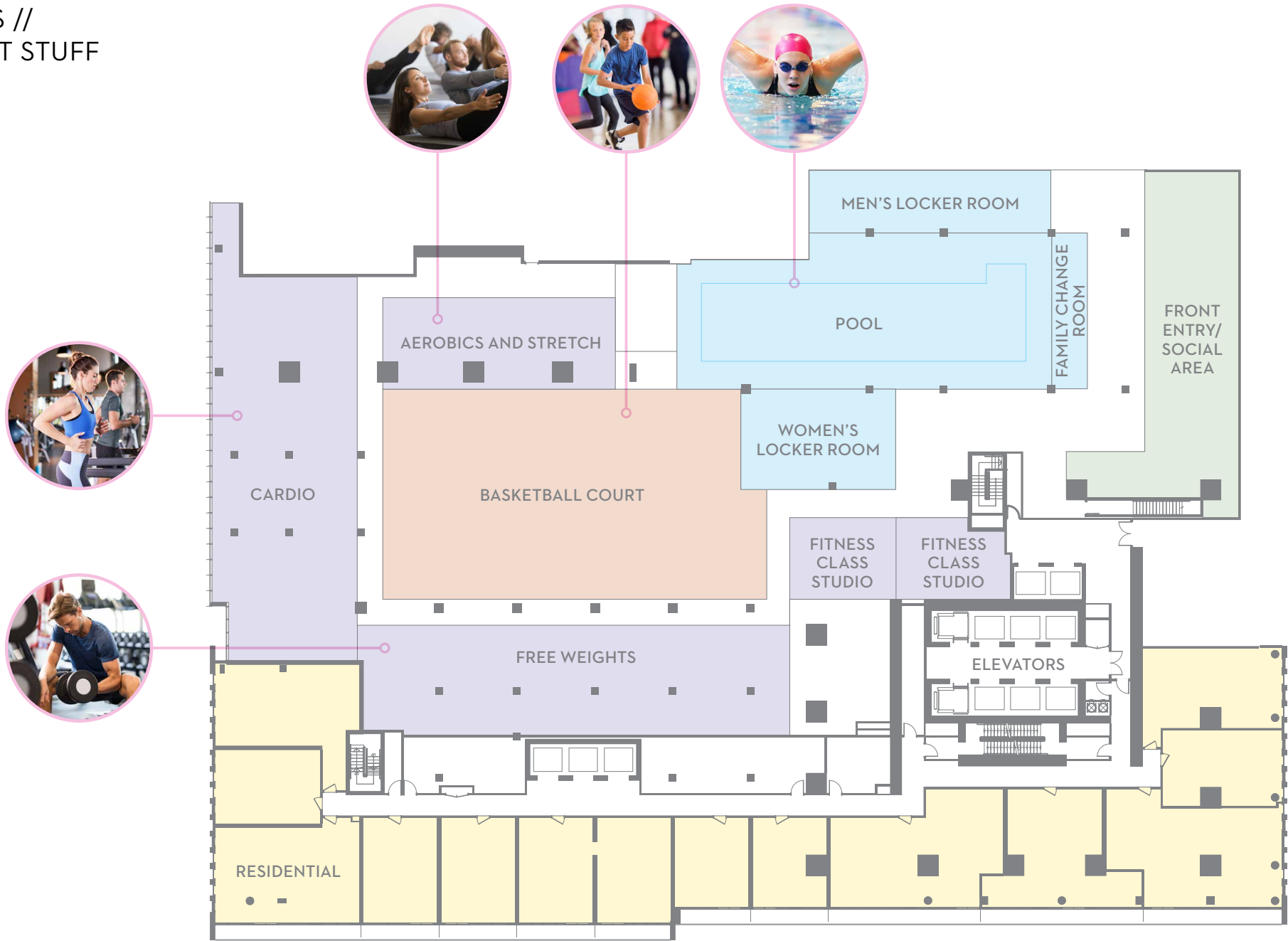
STATE OF THE ART FITNESS CENTRE