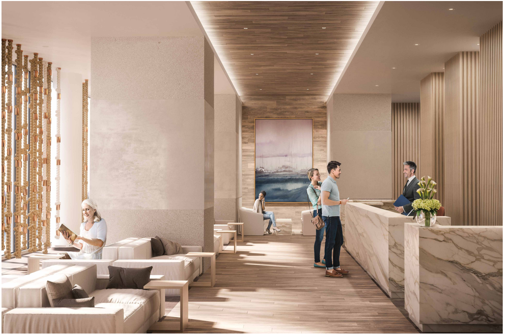
RESIDENTIAL CONDOMINIUM LOBBY