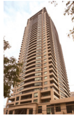
PLATINUM NORTH YORK