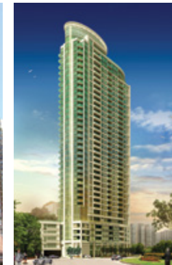
WIDE SUITES MISSISSAUGA