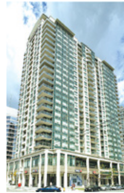
MAJESTIC 2 NORTH YORK

Building with five decades of excellence, The Conservatory Group is proud to be at the forefront of the industry, shaping new home communities across the Greater Toronto Area.