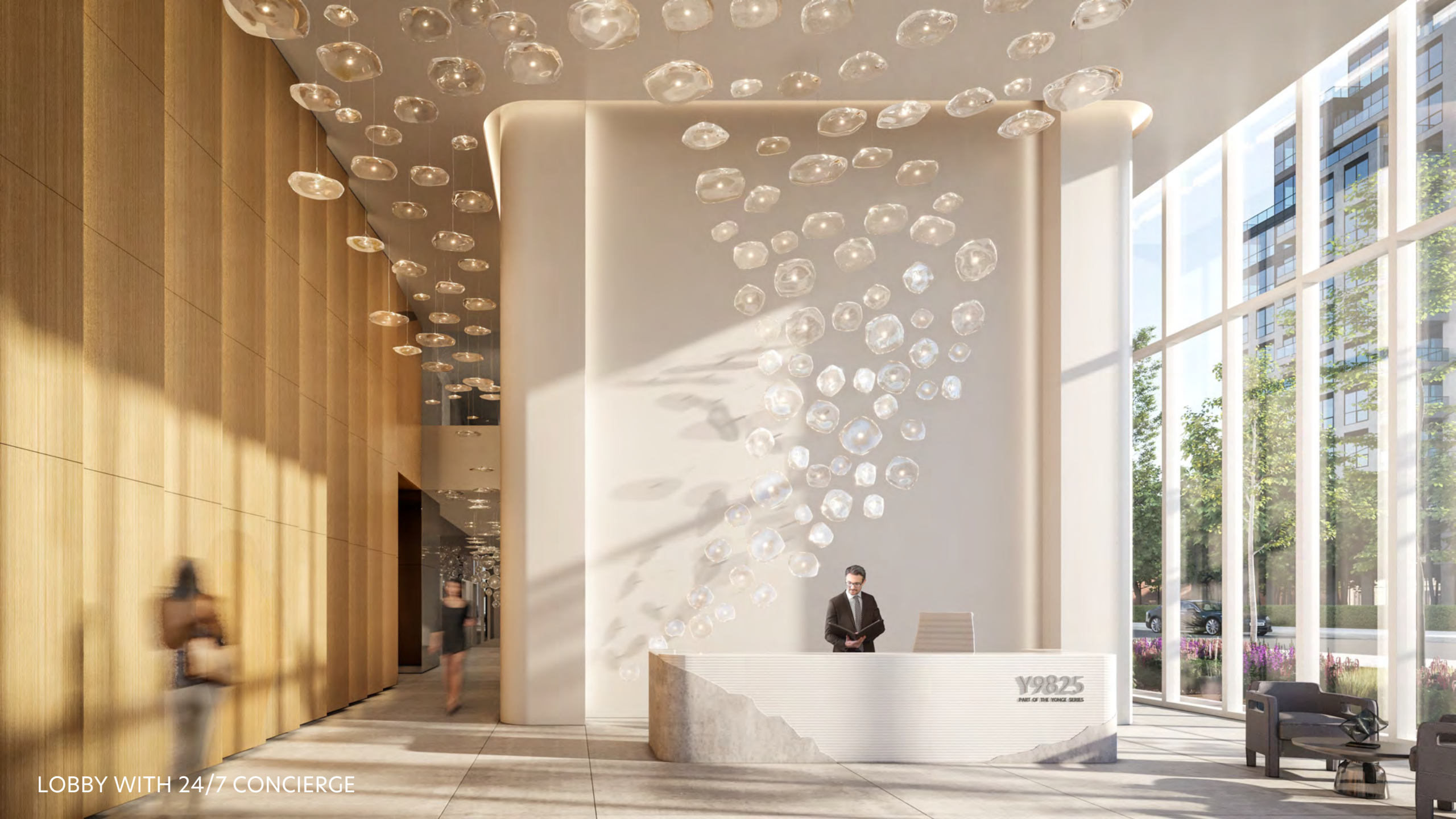
LOBBY WITH 24/7 CONCIERGE