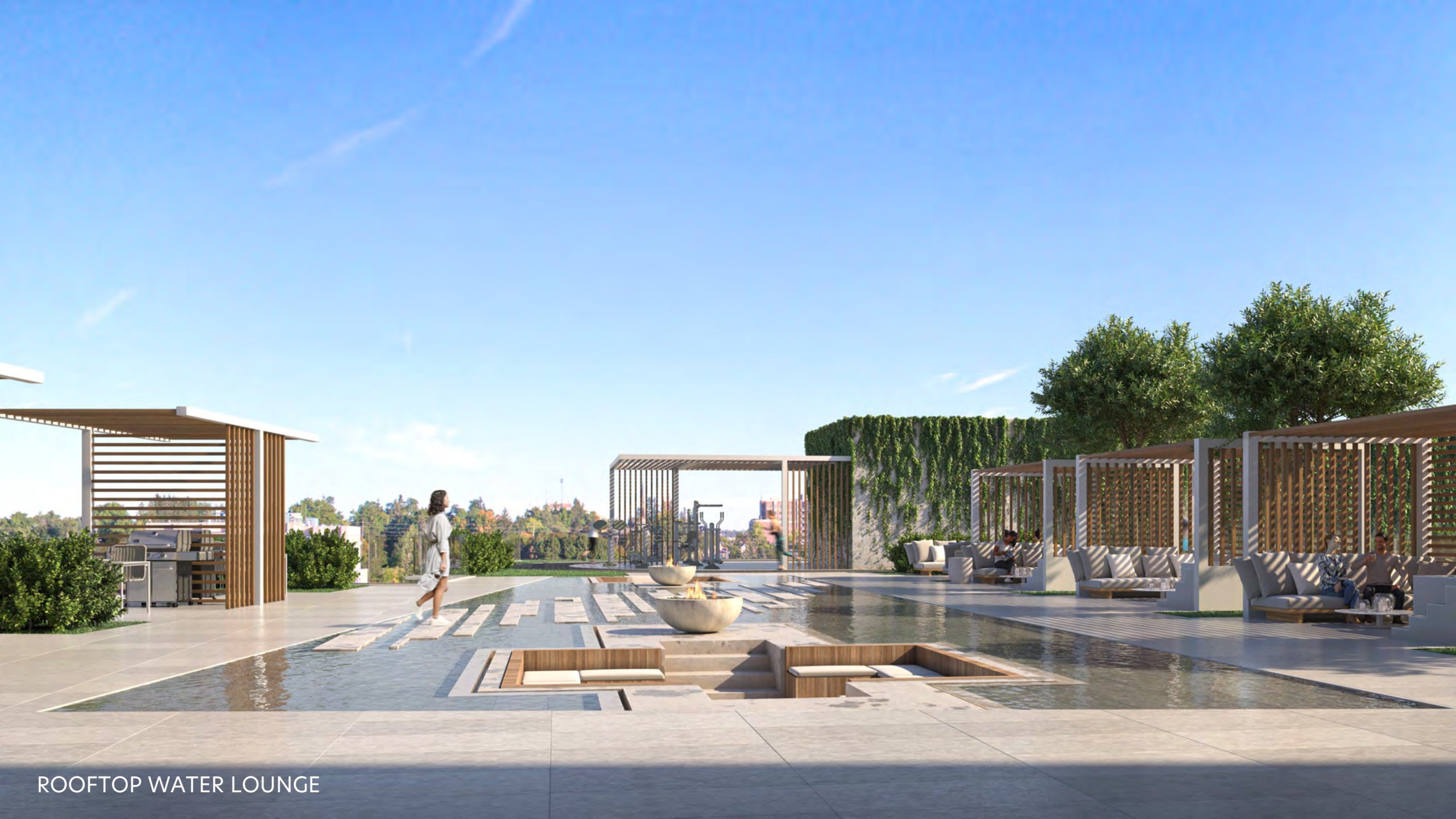
ROOFTOP WATER LOUNGE