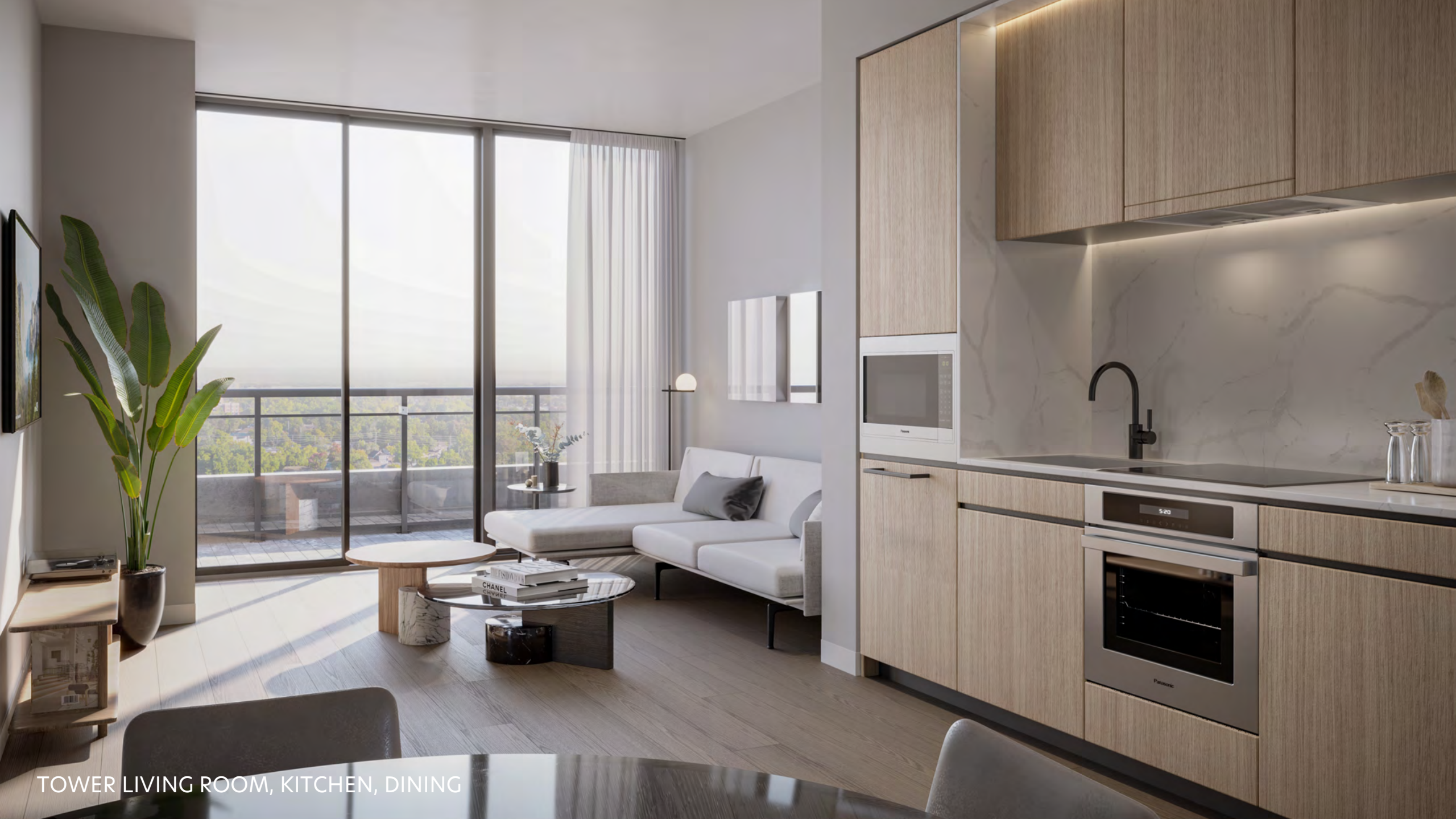
TOWER LIVING ROOM, KITCHEN, DINING