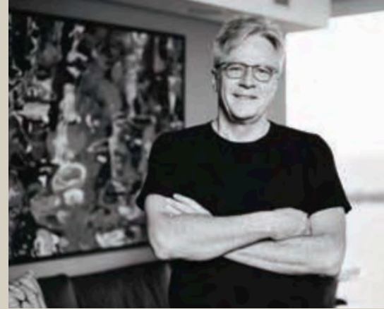
Rudy Wallman WALLMAN ARCHITECTS

Warm and modern with hotel-style interior design by Truong Ly Design, as well as a uniquely striking architectural presence by Wallman Architects, Y9825 was conceived to enable its residents to truly make the most of the world class city in which we live.