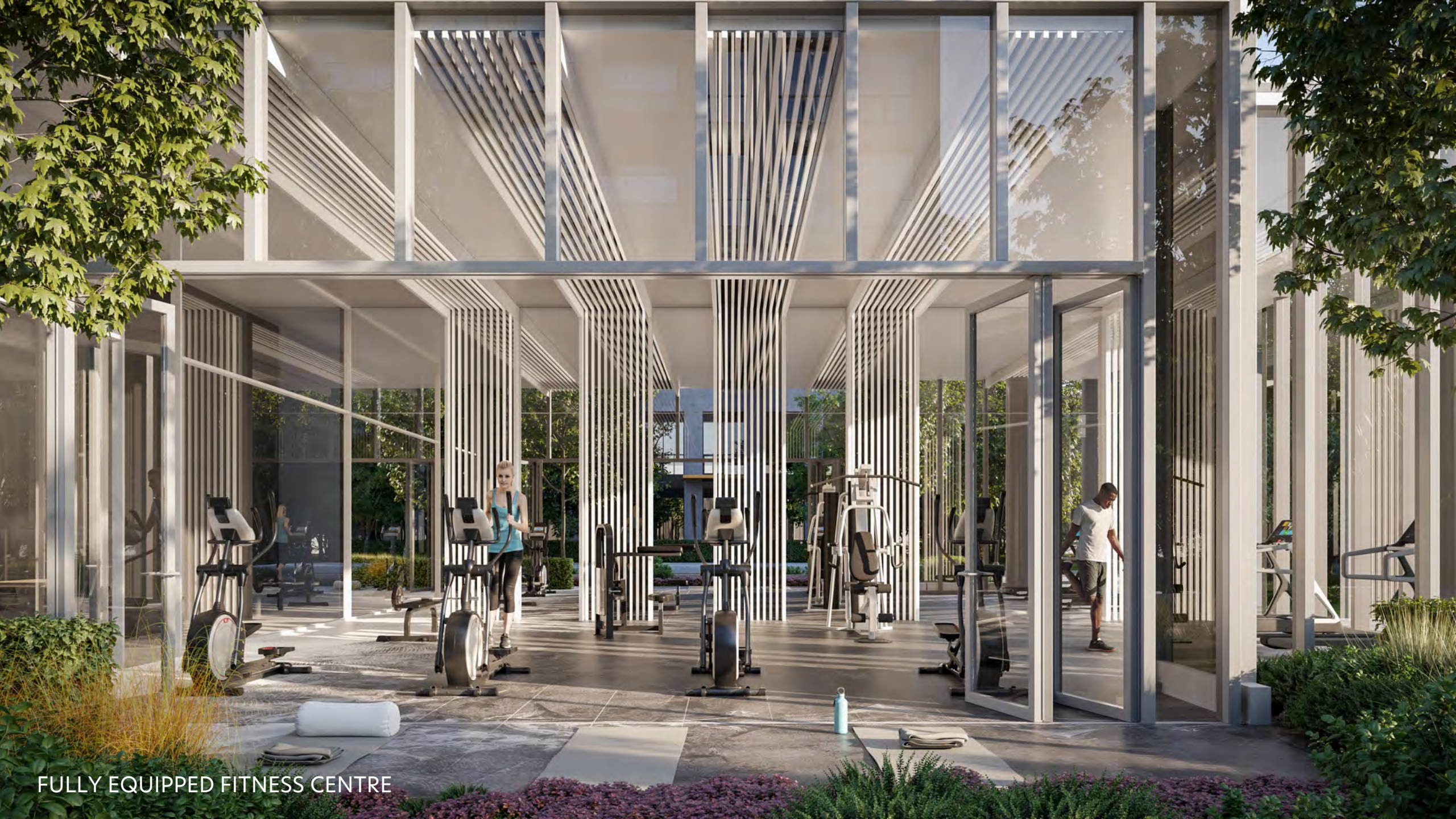
FULLY EQUIPPED FITNESS CENTRE