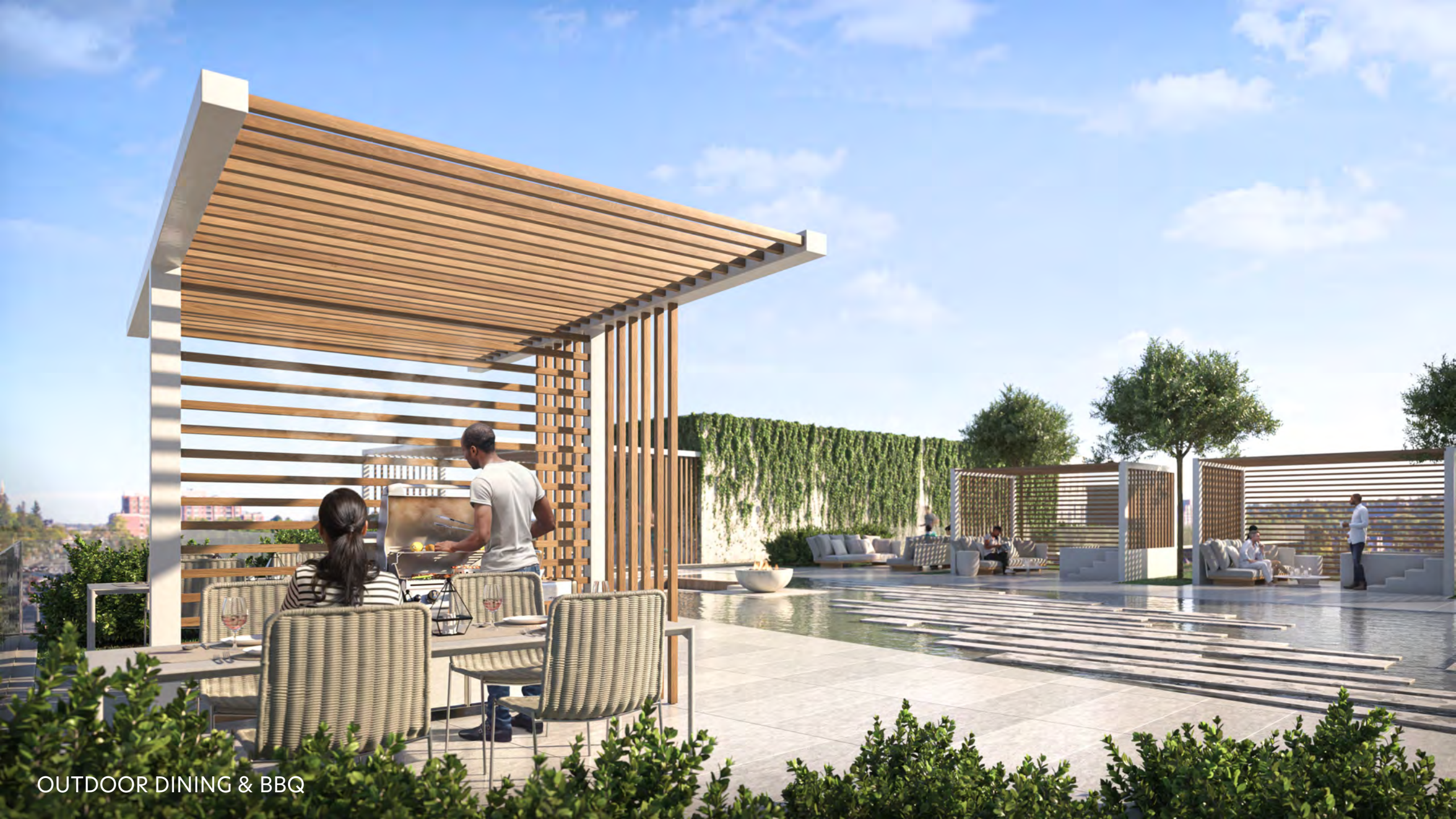
OUTDOOR DINING & BBQ