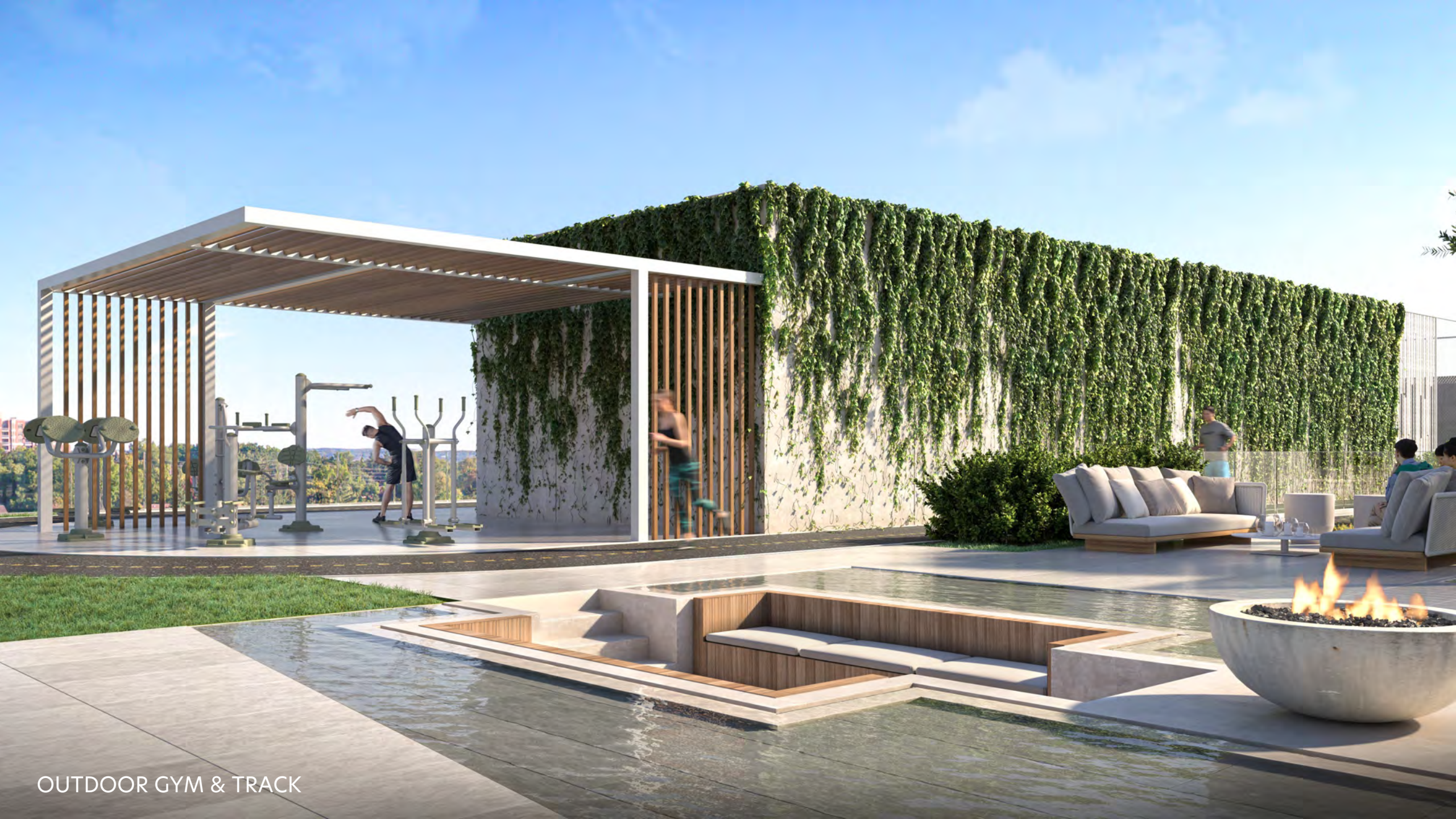
OUTDOOR GYM & TRACK